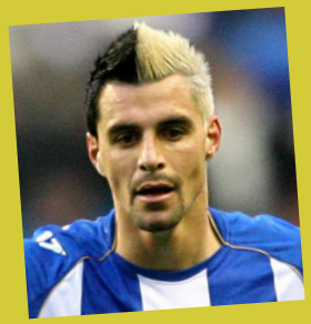
How do you decide?

The Player: Austrian retired footballer. He operated mainly as a defender, although he could play almost every midfield position as well. He was known for his great flexibility and haircuts.