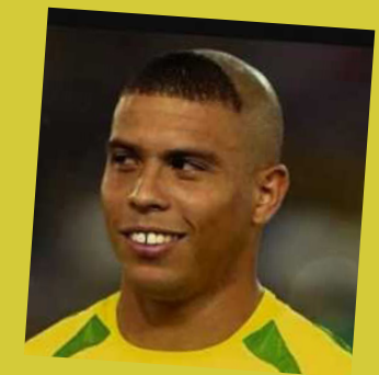
Can I have a semi-circle fringe please?

The hairstyle: This hairstyle is neither a mohican, nor a 'baldy', but it is very dodgy indeed.