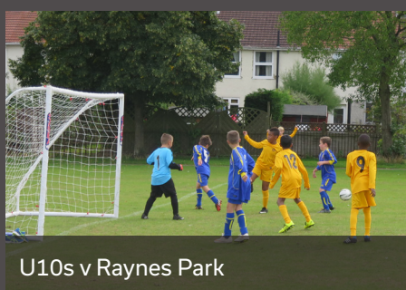
U10s v Raynes Park