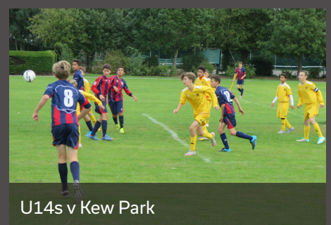
U14s v Kew Park