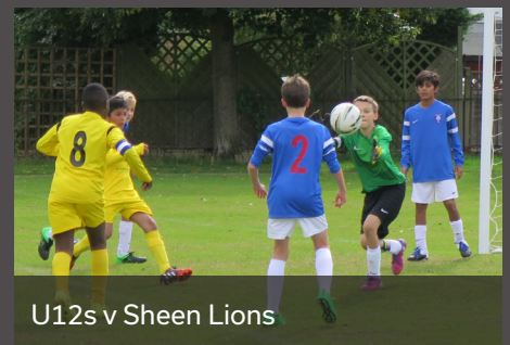
U12s v Sheen Lions