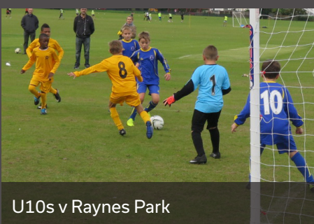
U10s v Raynes Park