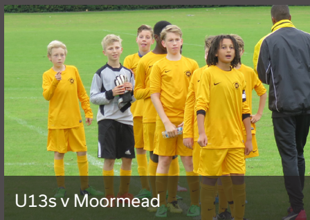
U13s v Moormead