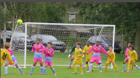
U11s v Doverhouse